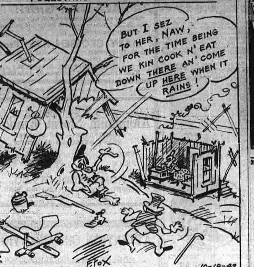
BY HERB HERRER