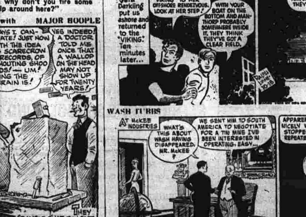
BY LESLIE FUNNELL