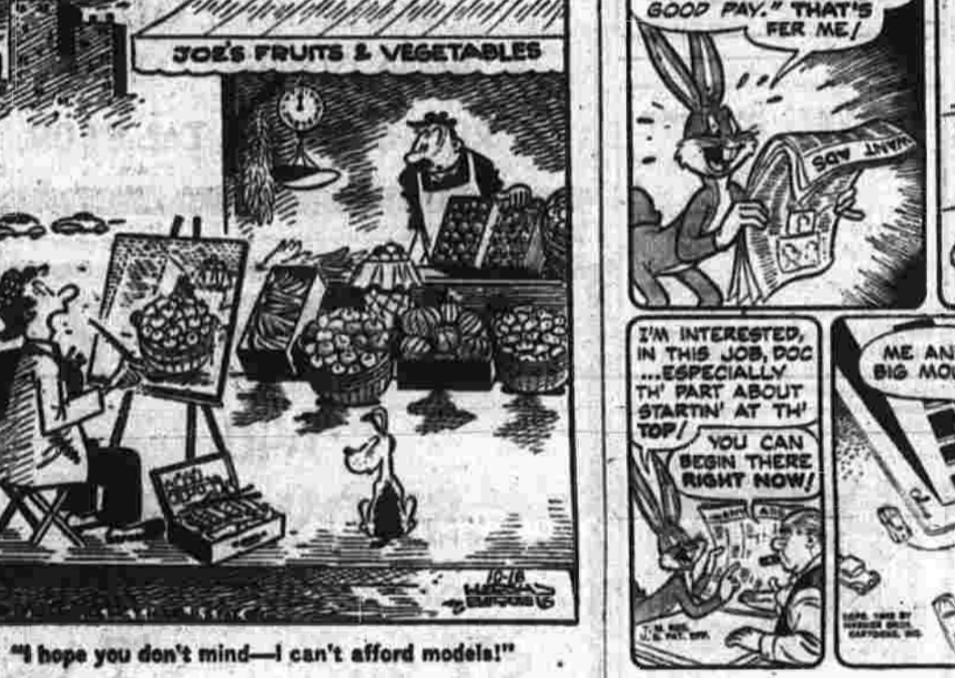
BY HERB HERRER